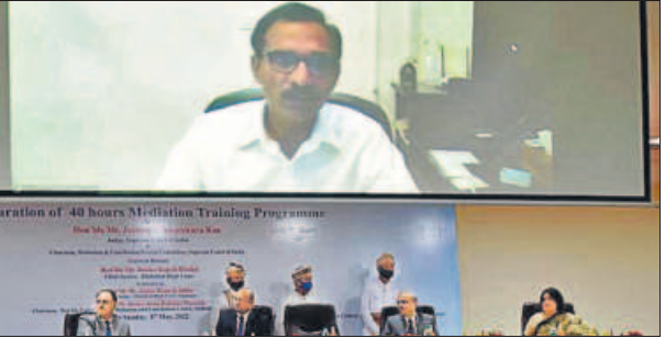
The inaugural session of the mediation training programme organised by the Lucknow bench of the Allahabad HC in Lucknow

LUCKNOW : Justice L Nageswara Rao of the Supreme Court on Sunday stressed on the importance of pre-litigation mediation to resolve disputes and promotion of mediation by lawyers who think it will result in loss of work for them. Justice Rao virtually addressed an inaugural session of the mediation training programme organised by the Lucknow bench of the Allahabad high court on the high court campus in Lucknow. Justice Rao stated that pre-litigation mediation was the best way to resolve disputes. He asserted that lawyers are apprehensive that mediation would lead to loss of work (cases) for them but this is not the case. Resolution of disputes through mediation would repose faith of people in the judicial system and it would bring more work for them (lawyers), Justice Rao said. Lawyers must play the role of a conflict manager as they are better