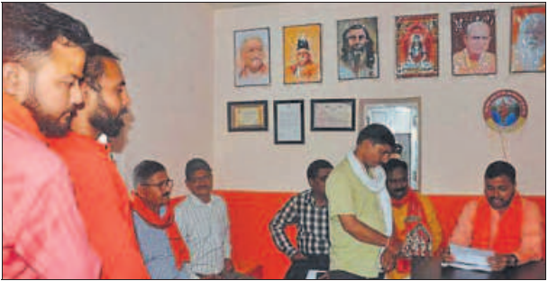
Hindu Yuva Vahini office at the Gorakhnath Math in the crowded Maidagin area of Varanasi.

VARANASI : A new signboard mentions the Hindu Yuva Vahini with an arrow pointing at the refurbished office at the Gorakhnath Math in the crowded Maidagin area of Varanasi. Floated by Yogi Adityanath, the then Gorakhpur MP and present UP chief minister, Hindu Yuva Vahini (HYV), which had kept a low profile for about four years, is in expansion mode in the Varanasi region in 2022 through a daily jan sunvai (public hearing) programme launched in the first week of April. During the jan sunvai held for two hours daily, a senior officer bearer of the Hindu Yuva Vahini sits at the office and listens to the complaints of the people and gets their problems solved.