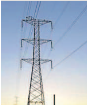
The UPPCL's average current aggregate technical and commercial (AT&C) losses are as high as more than 29%. FILE

LUCKNOW : Claims notwithstanding, it may be a tall order for the loss-ridden UP Power Corporation Ltd (UPPCL) to cut the mounting distribution losses (a euphemism for power theft) to half in next four years, even as the Centre has recently approved funds of more than ₹16,000 crore for the purpose, said people aware of the issue. With poor collection efficiency and rampant power theft, the UPPCL's technical and commercial losses in the state only rise further when it increases power supply to consumers, often neutralizing the gains (to a large extent) it makes by making efforts to contain the losses. The UPPCL, in December 2021, forwarded a proposal to the Centre, seeking a financial assistance to the tune of around